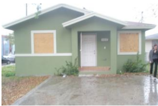
Above: A photo of the home awarded via the NSP Single-Family Home Award Program.

Community Development programs have had a significant impact upon the City of Miami through economic development, capital improvements, housing, and public service activities. Since 1975, the CDBG program has been providing local government with the resources necessary to assist persons of low- and moderate-income. CDBG funds pay for the following services in Miami: (1) Public Services: childcare and elderly programs including meals and transportation services for seniors, after school care and youth services for kids, services for the homeless, and programs that provide an alternative to incarceration; (2) Housing: down payment assistance to first-time homebuyers, rehabilitation assistance for homeowners who need to keep their homes up to code, and the replacement of uninhabitable single-family homes; (3) Economic Development: grants and loans to for-profit business for job creation, façade improvements for small businesses, assistance to micro-enterprises (businesses of five persons or less), rehabilitation of businesses to satisfy code compliance issues, and street improvements. The Department of Community Development celebrates CDBG and its importance to the City of Miami's neediest populations.