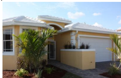
Left: The new affordable home features three bedrooms, two bathrooms and countless green features.