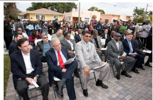
Below: More than 50 people attended the ribbon-cutting including numerous City of Miami officials