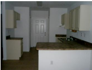
Above: A look at the kitchen of the home in Little Haiti.